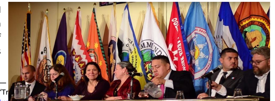
Representatives of the Pilot Project Tribes at 2014 Indian Nations Conference

TLPI, one of the technical assistance providers supporting the work of the ITWG, has also developed an in-depth guide for implementation of Tribal Law and Order Act and VAWA 2013. 46 In addition, representatives of the Pilot Project tribes and the technical assistance team have presented at numerous conferences and meetings across Indian country with the goal of educating other tribes