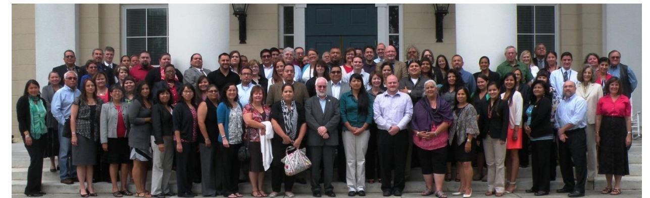
Intertribal Technical Assistance Working Group at first formal meeting

The first formal in-person meeting of the ITWG was hosted at DOJ’s National Advocacy Center in Columbia, South Carolina on August 20-21, 2013. The ITWG divided into topical breakouts on: code development and publication; jury selection, judicial requirements, and recording proceedings; and victims’ rights, law enforcement training and detention. Defender issues and defendants’ rights were focused into a “Tribal Defender Advisory Group.” The ITWG also divided into tracks based on readiness: getting started; ramping up; and final stages. Tribal participants from justice systems that were already equipped to implement SDVCJ readily shared information with others who were in more preliminary stages of planning.