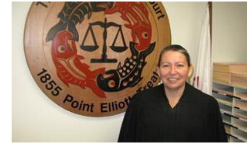
Chief Judge Theresa Pouley, Tulalip Tribal Court

Confederated Tribes of the Umatilla Indian Reservation (CTUIR): The Tribes appoint state-licensed public defenders to any criminal defendant that requests one, including on appeal. Although the Tribes’ indigence standard is set at 150% of the federal poverty guidelines, as a matter of practice the Tribes provide indigent counsel regardless of income to anyone who requests it. 33