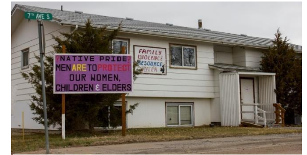
Ft. Peck Family Violence Resource Center

Pascua Yaqui: The Tribe does not use VAWA 2013’s definitions of domestic and dating violence in its tribal code. These offenses are defined by language devised by the Tribe. The tribal code includes a maximum statement of jurisdiction that it has authority over “all subject matters which, now and in the future, are permitted to be within the jurisdiction of any Tribal Court of any Indian tribe recognized by the United States of America.” 38