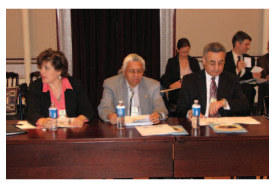
NCAI Executive Committee at White House meeting.