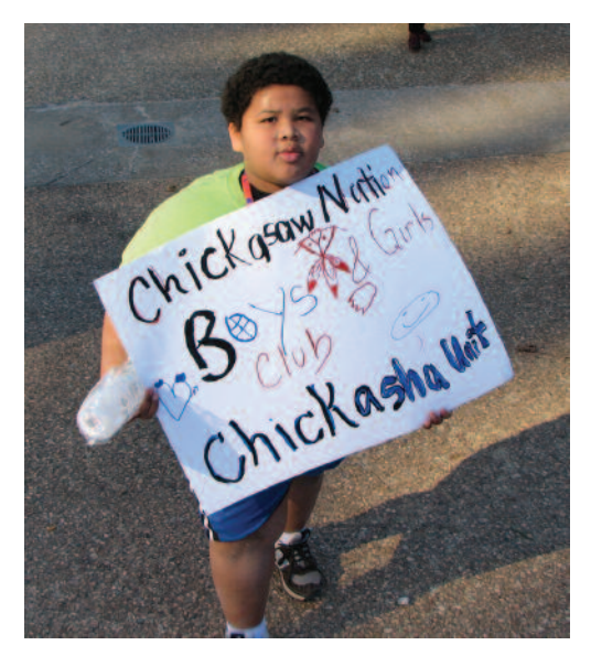
One of many youth who participated in NCAI's Annual Health and Fitness Walk at the 62nd Annual Convention in Tulsa.

families and communities at large in an effort to promote healthy lifestyles community-wide.