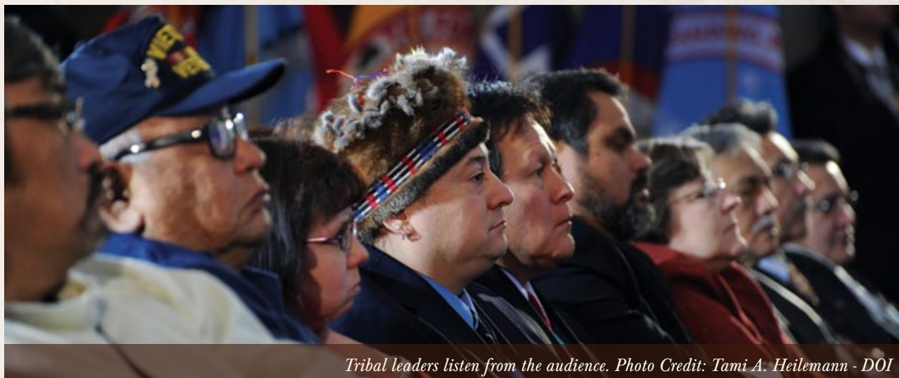
Tribal leaders listen from the audience.