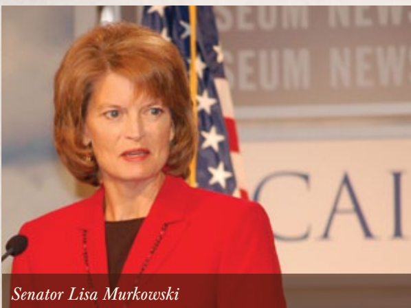
Senator Lisa Murkowski