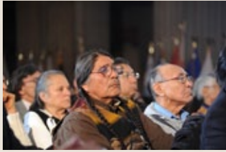
NCAI Hosts Tribal Leader Summit Preparatory Strategy Meetings

In days leading up to the Tribal Nations Summit, NCAI and regional intertribal organizations brought together tribal leaders to establish a unified vision for Indian Country.