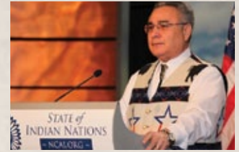
State of Indian Nations Address