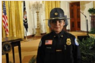
First Meeting of the Indian Law and Order Commission

Sponsored by USET, NCAI, and ATNI, the Tax Summit at Miccosukee brought tribal leaders together to discuss tribal economic independence and develop an economic development strategy.