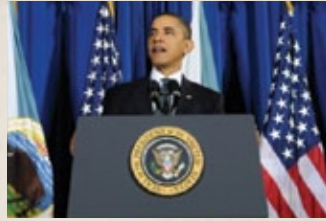
Obama Announces Support for UN Declaration

During his opening remarks at the second White House Tribal Nations Summit, the President announces support for the UN Declaration on the Rights of Indigenous Peoples.