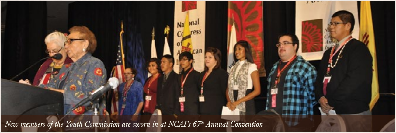
New members of the Youth Commission are sworn in at NAIA's 67 th Annual Convention