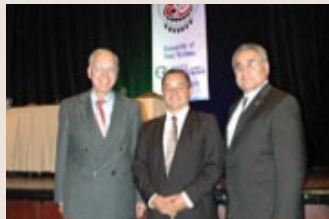
International Indigenous Summit on Energy & Mining

Tribal leaders gather on Capitol Hill to rally against the Carcieri v. Salazar decision.