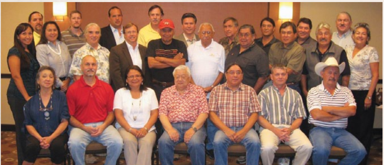
Members of the Our Natural Resources alliance gather for a meeting. NCAI's PTG is a coordinating member of the group.