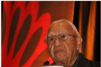
Indian Country Leadership Awards Announced