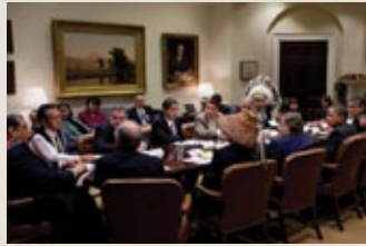
President Obama Holds Direct Talks at White House

President Obama meets with 12 tribal leaders in advance of the 2010 White House Tribal Nations Summit.