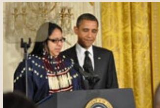
One Year Anniversary of Tribal Law & Order Act