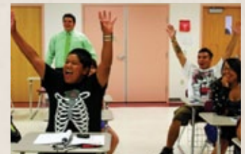
National Intertribal Youth Summit