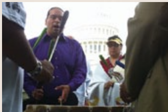
Carcieri Rally on Capitol Hill

Tribal leaders gather on Capitol Hill to rally against the Carcieri v. Salazar decision.