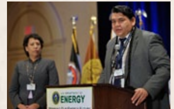
Department of Energy Summit

The Indian Law and Order Commission, established in 2010 with the signing of the Tribal Law & Order Act, plays a critical role in implementation of the law.