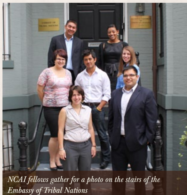
NCAI fellows gather for a photo on the stairs of the Embassy of Tribal Nations