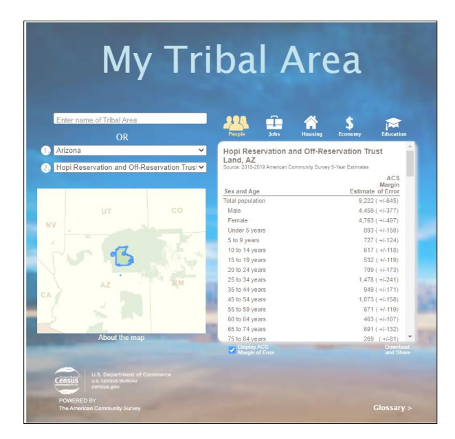
Figure 2. My Tribal Area, U.S. Census Bureau – Example of Data Displayed for the Hopi Reservation and Off-Reservation Trust Land, Arizona under the "People" tab

The U.S. Census Bureau created a portal called "My Tribal Area" that allows access to data for census tribal geographies from the latest ACS five-year estimates. My Tribal Area includes a simple drop-down menu to select a single Tribal Area or select a state and then select the Tribal Area within that state. Data categories available include information about people, jobs, housing, the economy, and education. Data are presented as an estimate with margins of error to help users understand the relative accuracy of the estimate provided in the data. Comments from Tribal Leaders often include questions about the accuracy of the data in My Tribal Area, especially since federal and state agencies and other funders often request or require them to use census data in their grant or funding applications. The U.S. Census Bureau recently mentioned that they may add the 2020 Census data to My Tribal Area, but there are concerns about the quality and accuracy of that data due to several factors including closures due to COVID-19 during the count and issues with privacy protections to the data. Figure 2 is an image of My Tribal Area with a Tribal Nation selected, and the link to this webpage is here: https://www.census.gov/tribal/.