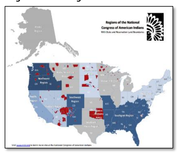
Figure 1: NCAI Regions

This report used the IPUMS National Historical Geographic Information System (NHGIS) tabulations of the 2020 Census P.L. 94-171 Redistricting Data File derived from the Legacy Format.¹ The data used in this report are from IPUMS Table 1 and include the AIANNH¹ Tribal Geographies, also referred to as tribal lands for this report. The data for this report includes racial and population data for the tribal lands.