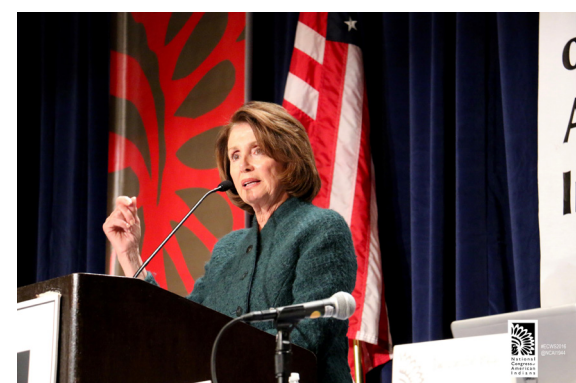
Minority Leader Nancy Pelosi (D-CA)