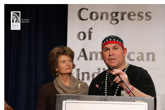
Senator Lisa Murkowski (R-AK)