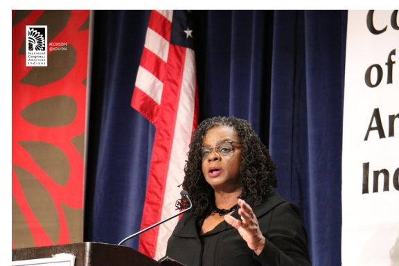
Congresswoman Gwen Moore (D-WI)