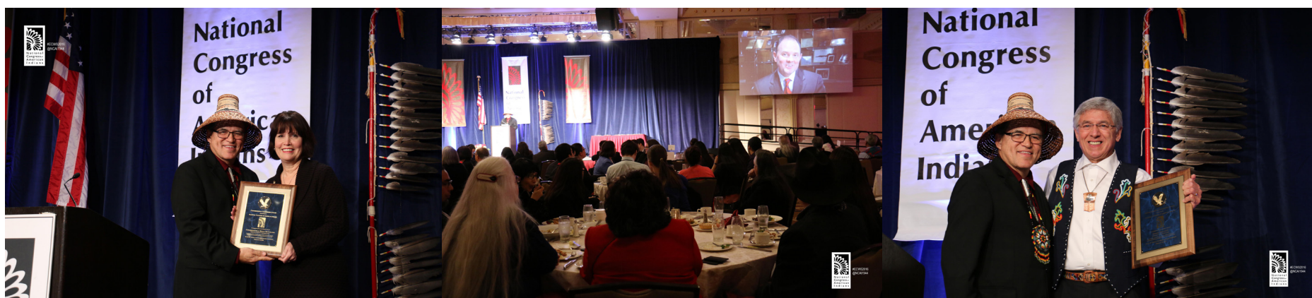
U.S. Representative Betty McCollum, Congressional Leadership Award