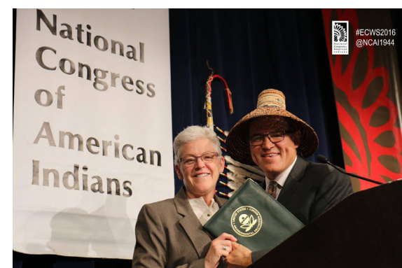
EPA Administrator Gina McCarthy