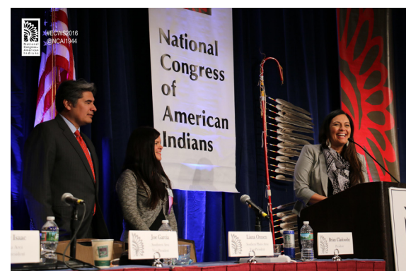
National Indian Women's Resource Center