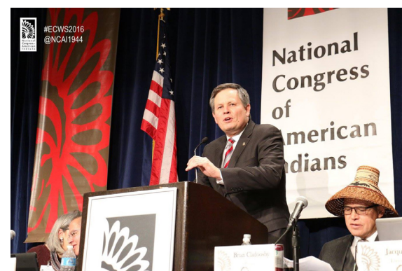
Senator Steve Daines (R-MT)

Congressman Frank Pallone (D-NJ) gave remarks highlighting the work around health care for Indian Country and his continued work on allowing tax credits for not only health services, but for renewable energy sources as well, and the need for the expansion of telecommunications through broadband infrastructure.