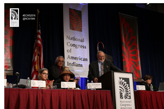
Congressman Don Young (R-AK)