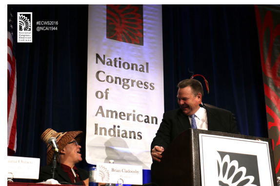
Senator Jon Tester (D-MT)