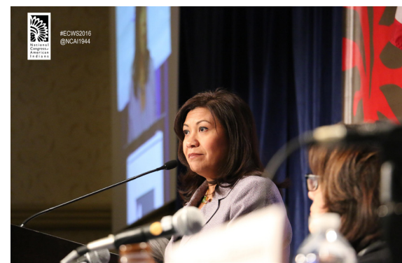
Congresswoman Norma Torres (D-CA)

“Housing of veterans and their families—HUD-VASH Program—is collaborative. It provides eligible homeless veterans a voucher for supportive services for physical and mental health problems, substance abuse, etc,” said Secretary McDonald. “For 2016, we have allocated $5.9