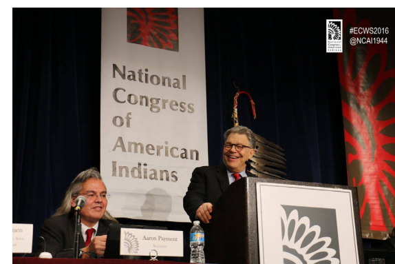
Senator Al Franken (D-MN)