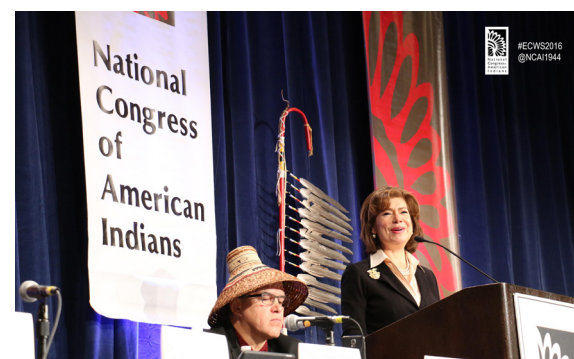
U.S. Small Business Administration Administrator, Maria Contreras-Sweet