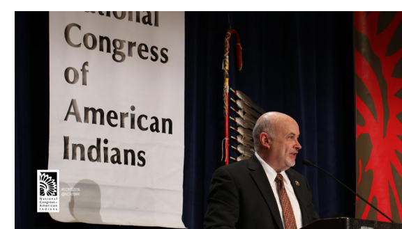
Congressman Mark Pocan (D-WI)