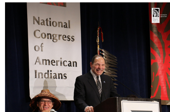
U.S. Department of Veterans Affairs Secretary Robert McDonald