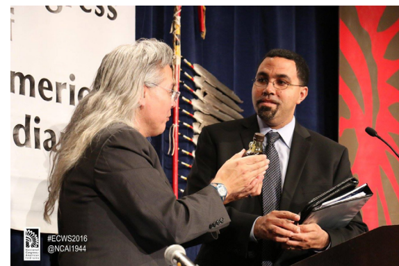
John King, Acting Secretary of the U.S. Department of Education

“Tribal sovereignty should be unchallenged—where you don’t have the authority to make decisions, you need to let us know,” said Lankford. “I don’t come with a piece of policy, I come with an idea: Let’s find a way to fix this for the future of our children—and let’s celebrate what we’re doing well.”