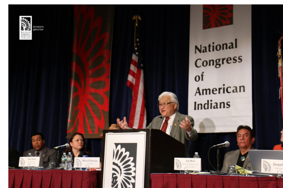
Representative Mike Honda (D-CA)