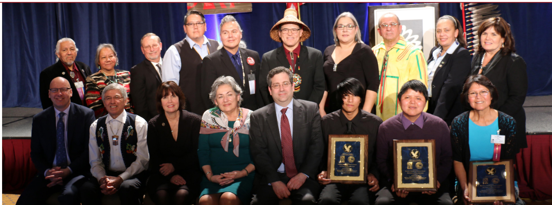
NCAI Board Members with this years nine outstanding honorees.