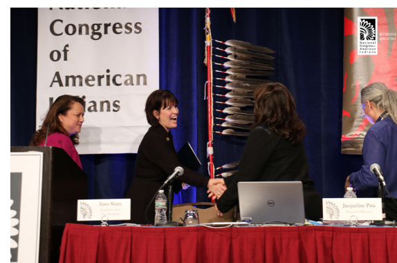
Congresswoman Betty McCollum (D-MN)