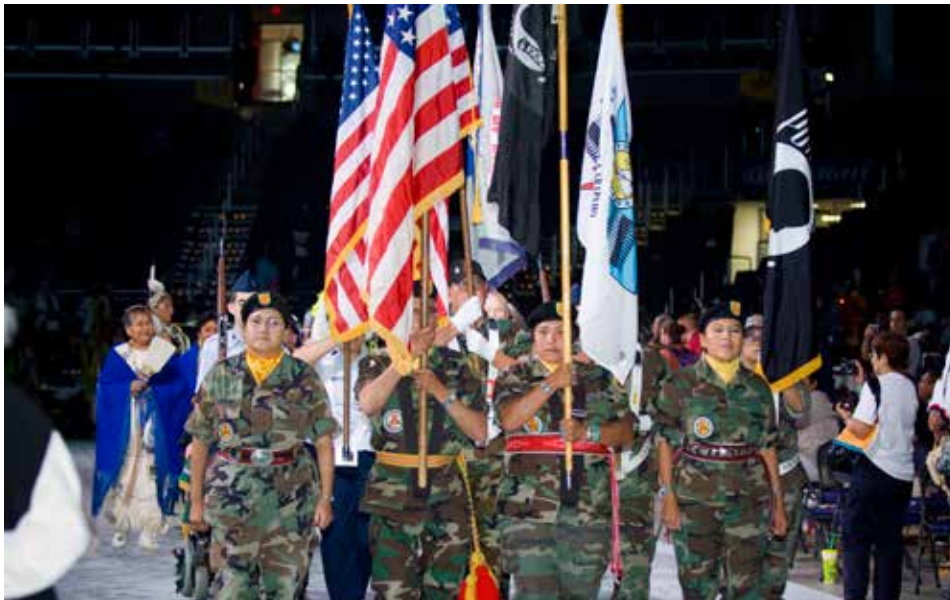
Vietnam Era Veterans Inter-Tribal Association Color Guard (VEVITA) leads the grand entry at the National Powwow. Washington, DC, 2007.