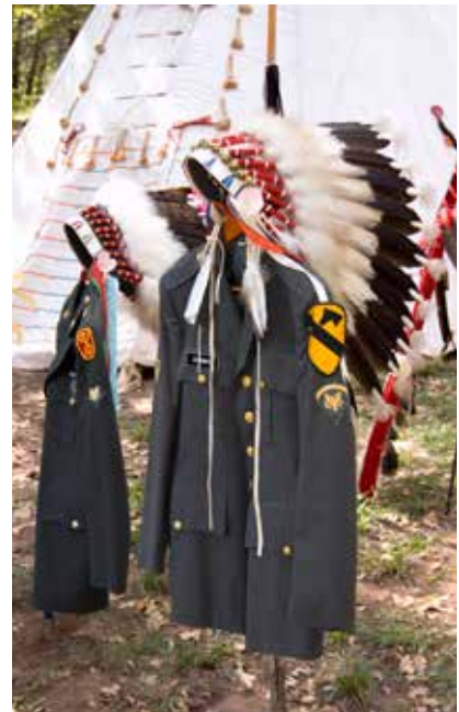
Eagle-feather war bonnets adorn U.S. military uniform jackets at a Ton-Kon-Gah (Black Leggings Society) ceremonial, held annually to honor Kiowa tribal veterans. Near Anadarko, Oklahoma, 2006. National Museum of the American Indian