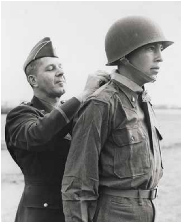
Chilocco alumnus Ernest Childers (Muscogee [Creek]) receives the Congressional Medal of Honor from Lieutenant General Jacob L. Devers (left). 5th Army headquarters, April 8, 1944.

Lieutenant Childers received the honor because, working under heavy enemy fire, he wiped out two German machine gun nests near Oliveto, Italy, killing enemy snipers and capturing an artillery observer.