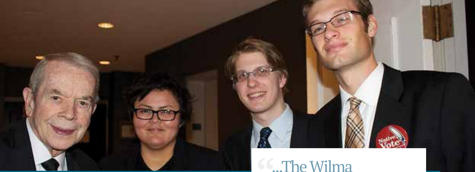
Former Congressman Dale Kildee pauses for a photo with participants in the NCAI fellowship and internship programs.