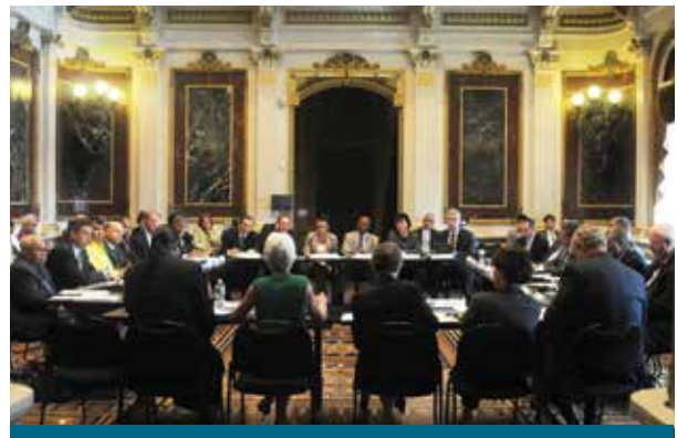
Members of the White House Council on Native American Affairs meet to coordinate policy to more effectively partner with tribal nations.

The Task Force will provide a place where organizations and grassroots supporters can keep each other informed, serving as the central point for coordinating and sharing events, opportunities, resources, and important youth work taking place throughout Indian Country.