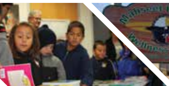
NCAI announces Native American taskforce for My Brother's Keeper 3