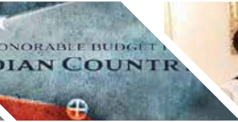
NCAI releases FY2015 Indian Country Budget Request