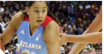
Shoni Schimmel selected in the first round of Women's National Basketball Association's draft by the Atlanta Dream 2