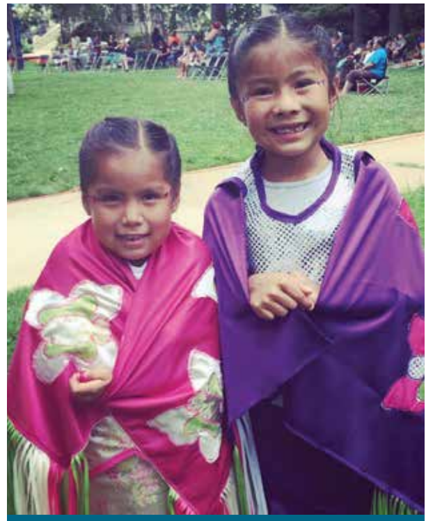
NCAI and our partners are launching First Kids 1st because every child is sacred.

visits, and trainings with Native youth providers, Native youth, adults, and Elders. The Department of Justice, Office of Justice Programs, Office of Juvenile Justice and Delinquency Prevention also served as a partner in 2013, providing support for the training events. The trainings offered Native communities valuable skills and strategies to support the resilience of Native youth and provided opportunities for dialogue around how the content could be more pertinent to their respective local communities. Trainings and feedback discussions occurred in seven diverse Native communities: New Town, North Dakota; Sacramento, California; Oakland, California; Old Town and Sipayik, Maine; Tyonek and Fairbanks, Alaska; Reno, Nevada; Hayward, Wisconsin; and the Pueblos of Pojoaque, Santa Clara and Ohkay Owingeh, New Mexico.