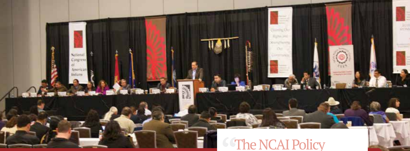
Tribal leaders and researchers applied data to the pressing issues facing Indian Country as part of the 9th annual Tribal Leader/Scholar Forum.

“The NCAI Policy Research Center was established 10 years ago to support Indian Country in shaping its own future...”