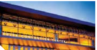
Mid Year Conference & Marketplace