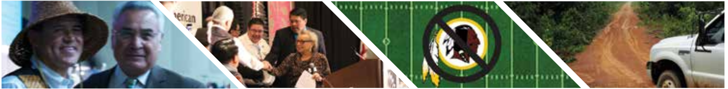
70th Annual Convention & Marketplace