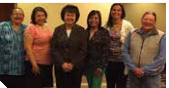
NCAI PRC hosts Diabetes Data Institute at Association of American Indian Physicians Conference in Denver, Colorado 5