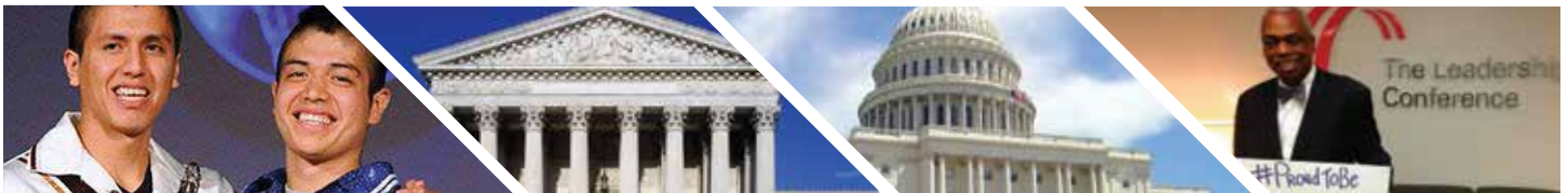
First Native Americans Honored with the Tewaaraton Award