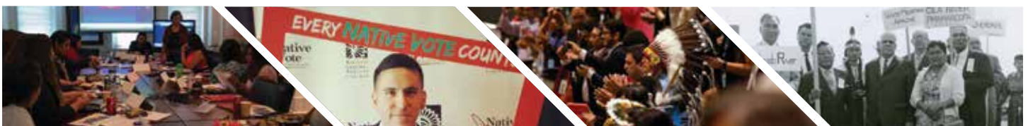
NCAI PRC hosts Native Youth Data Institute in Washington, DC