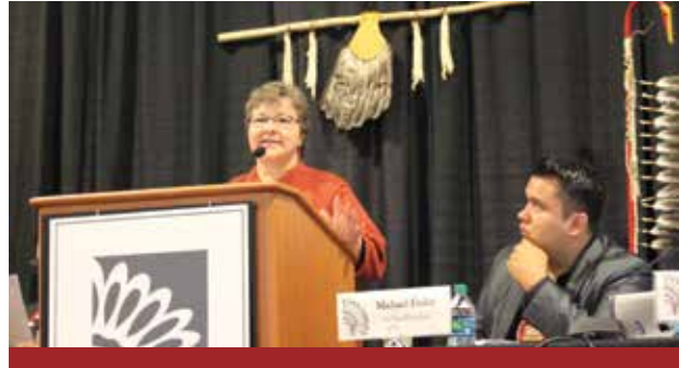
The Partnership for Tribal Governance provides technical assistance to equip and support tribal leaders as they shape policy for the next generation.

Addressing Issues Critical to Tribal Leaders. The PTG continued the Protect Native Money campaign to raise the visibility of financial education and consumer protection in Indian Country and to provide critical information and resources to tribal leaders and their citizens. With the settlement of the Cobell and Keepseagle class action lawsuits, Native individuals began receiving significant financial resources starting in August 2012. Additional Cobell settlement payments were expected in late 2013, however, these have been delayed until the fall of 2014. PTG staff provides support for the Native Financial Education Coalition (NFEC) and, in 2014, Partner News, an e-newsletter about financial capability efforts and resources in Indian Country, was launched alongside a new website, www.nfec.us . PTG staff serves on the President's Advisory Council on Financial Capability for Young Americans (PACFCYA) through which they seek to elevate the promising practices and unique role of tribal governments in promoting and providing financial capability resources to their young citizens. At the 71st Annual Conference in Atlanta, PTG will convene a financial capability summit and