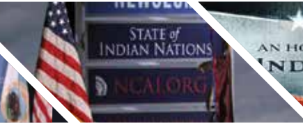
12th Annual State of Indians Nations