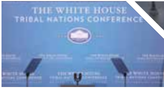
White House Tribal Nations Summit