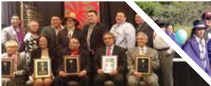
NCAI honors the 2014 NCAI Indian Country Leadership Award & Tribal Exchange winners