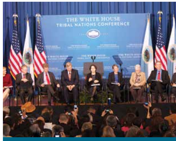
Members of the President’s Cabinet engage with tribal leaders during the townhall forum at the White House Tribal Nations Summit.

The afternoon session included a townhall hosted by the White House Council on Native American Affairs. The President provided closing remarks, committing to “keep our covenant strong.” As it has for each Summit, NCAI developed a Tribal Leader Briefing Book and hosted a preparatory meeting in partnership with regional intertribal organizations.