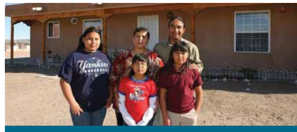
Though housing barriers persist in Indian Country, NCAI is working to empower tribes to develop quality, safe, and affordable housing for their citizens.