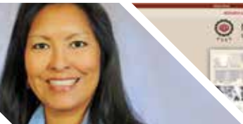
Diane Humetewa becomes first Native American woman to be confirmed as a federal judge