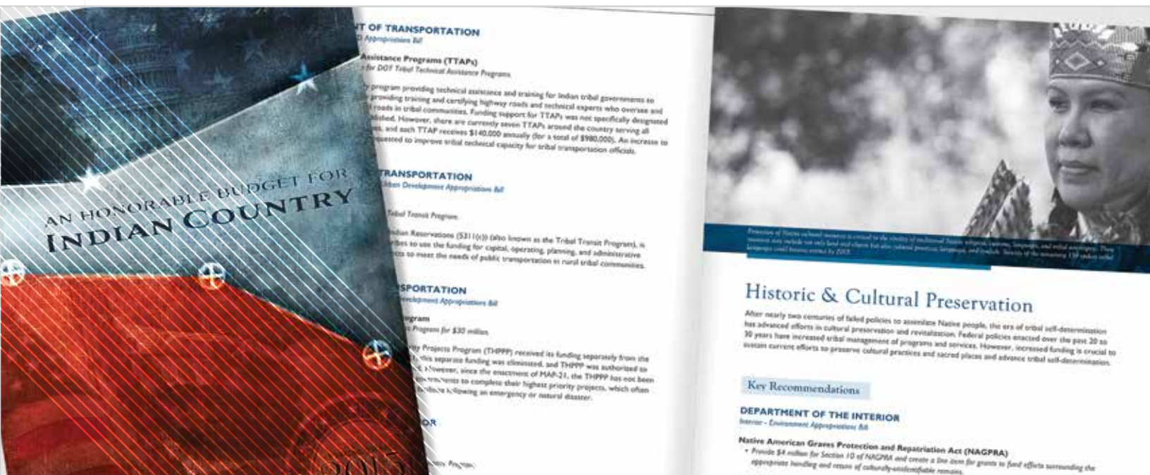
NCAI released our FY2015 budget document, "An Honorable Budget for Indian Country," in January 2014.

Moreover, shrinking resources due to sequestration and the 2011 Budget Control Act have adversely affected tribes’ ability to meet the needs of their communities. NCAI has called for an honorable budget for Indian Country, which will empower tribes so they can provide their people with good health care, quality education, decent and adequate housing, and public safety. These services—the basic services to which all Americans are entitled—meet the needs of Native peoples, benefit residents of surrounding communities, and—if adequately funded by Congress—fulfill longstanding obligations to tribal nations.