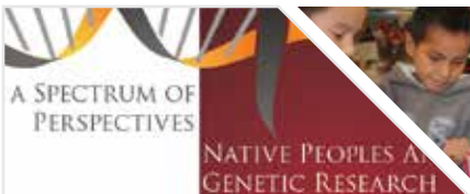
NCAI PRC co-hosts "A Spectrum of Perspectives: Native Peoples and Genetic Research" at the National Museum of the American Indian with the National Human Genome Research Institute