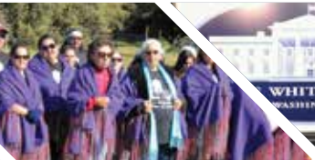
One year anniversary of the passage of the Violence Against Women Act Reauthorization