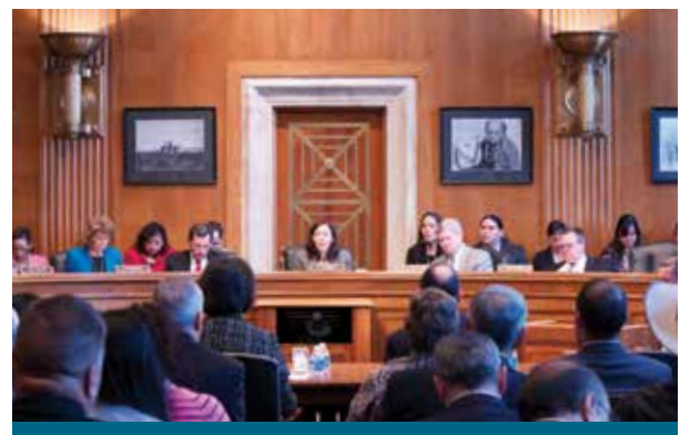
Members of the Senate Committee on Indian Affairs receive testimony from tribal leaders at a Senate hearing on budget issues facing Indian Country.

of acres of land that made the United States what it is today and, in return, tribes have the right of continued self-government and to exist as distinct peoples on their own lands. Part of this trust responsibility includes basic governmental services in Indian Country, funding for which is appropriated in the discretionary portion of the federal budget. As governments, tribes must deliver a wide range of critical services, such as education, workforce development, and first-responder and public safety services to their citizens. The federal budget for tribal governmental services reflects the extent