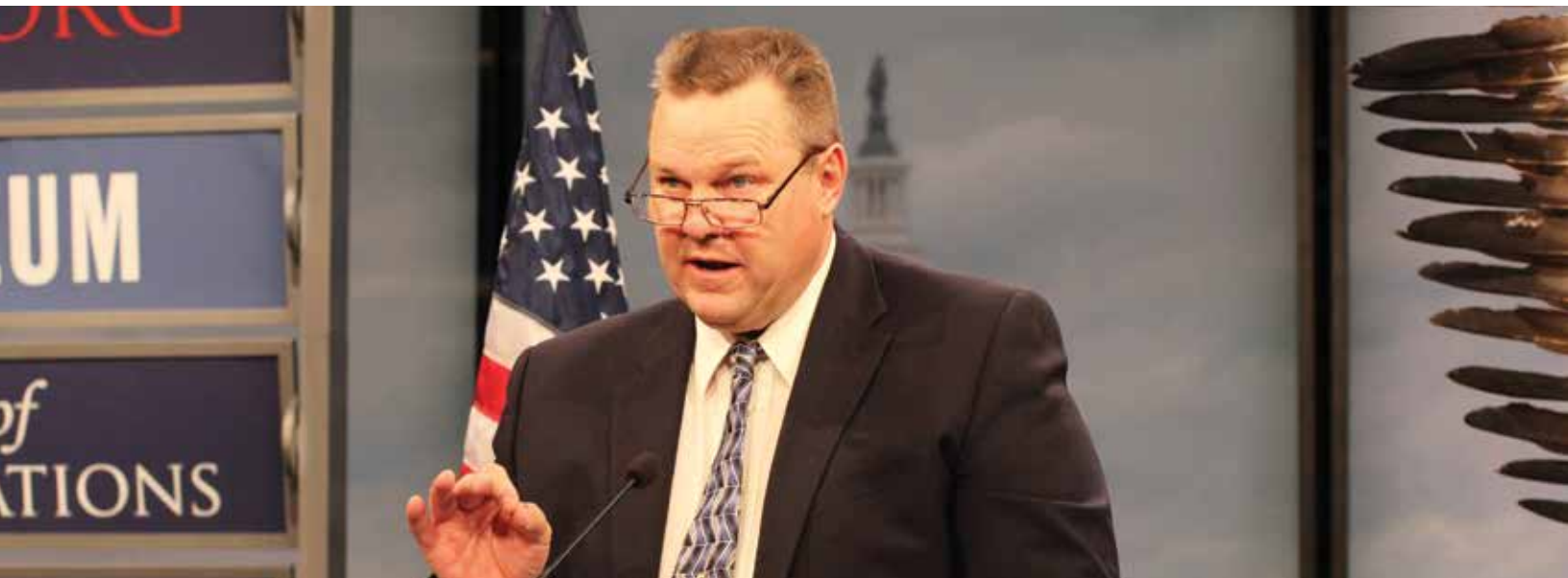
Senator Jon Tester (D-MT) delivers the Congressional response to the State of Indian Nations address.