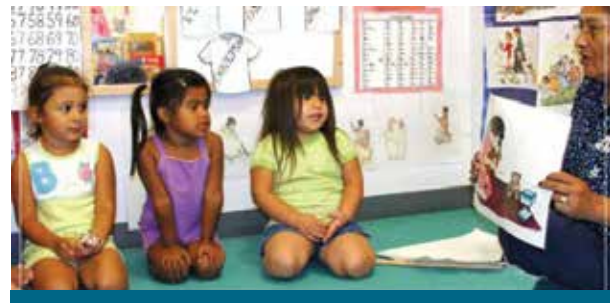
Story time at a Native language immersion school.

NCAI has advocated in all of these realms and will continue to ensure Native languages and culture play a central role in affording a high-quality, holistic education to all Native students.