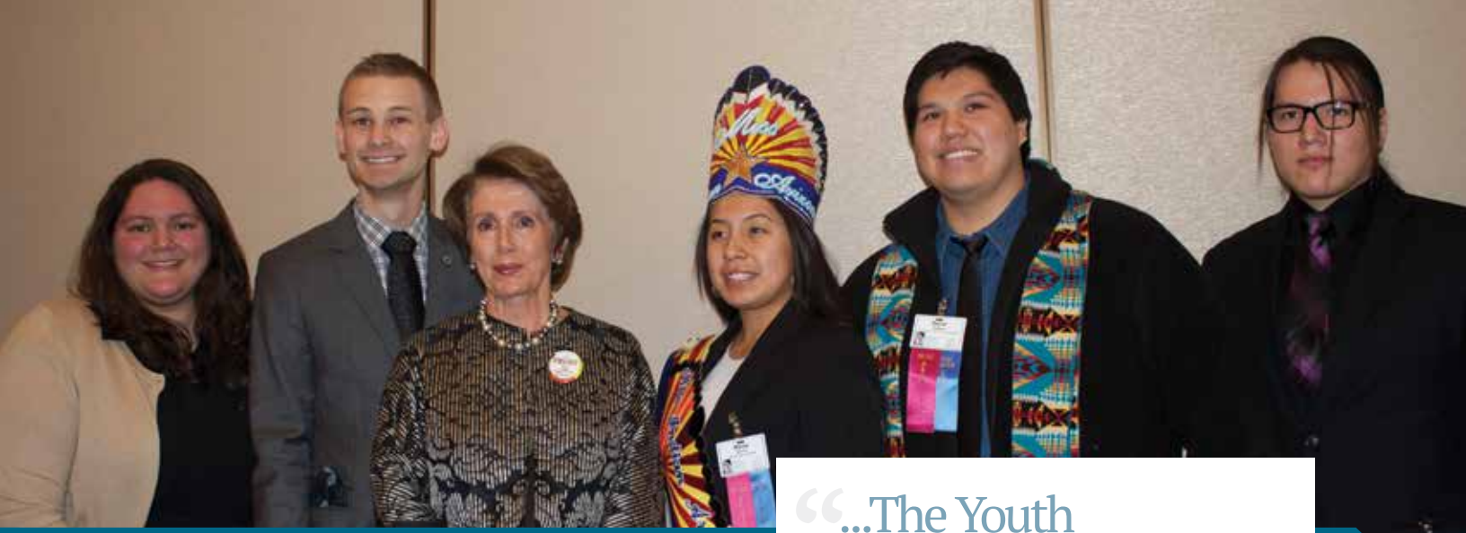
Members of NCAI's Youth Commission meet with House Democratic Leader, Nancy Pelosi, at the Executive Council Winter Session.