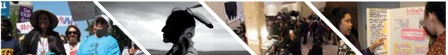
Confederated Tribes of the Umatilla Indian Reservation, Pascua Yaqui Tribe, and Tulalip Tribe begin exercising Special Domestic Violence Criminal Jurisdiction under VAWA 2013