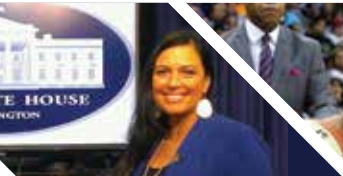
Native people honored as part of the White House "Champions of Change"