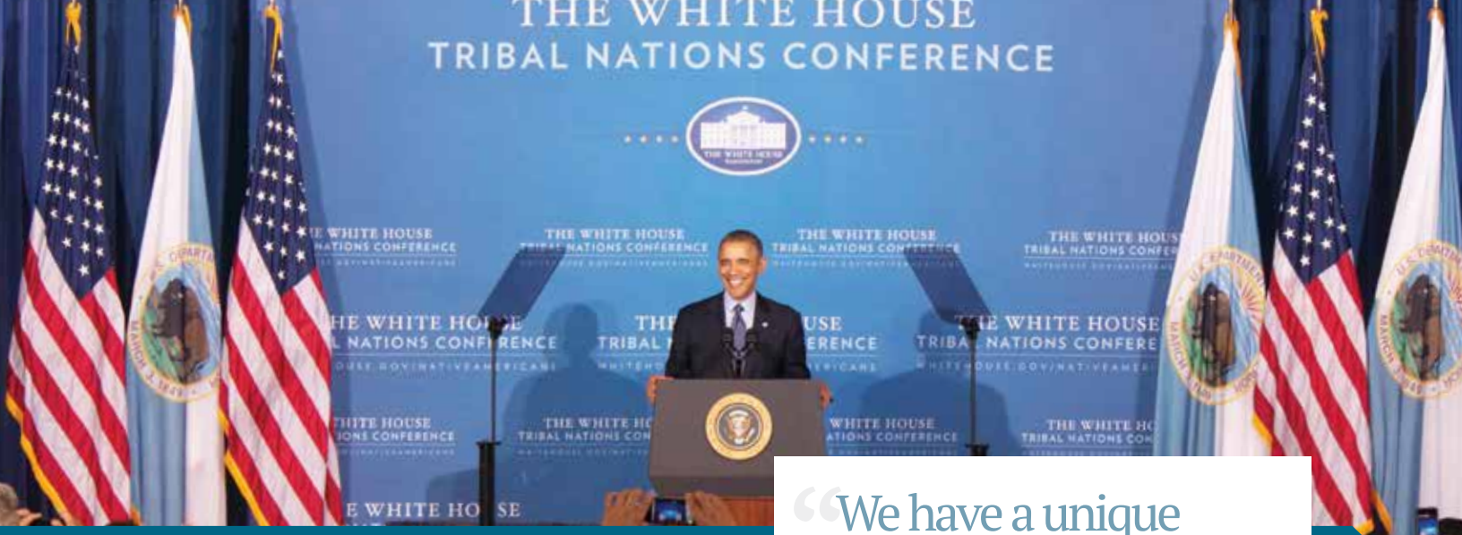
President Obama delivers closing remarks at the 2013 White House Tribal Nations Summit.

“We have a unique legal and political relationship...and while we should be proud of what we’ve achieved together in recent years, we also should be focused on all the work that we still have to do.”