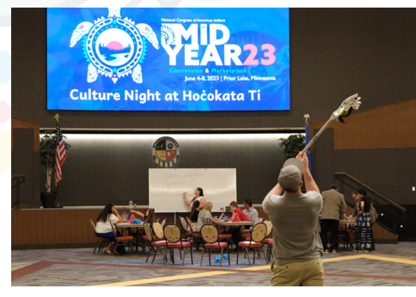
Attendees enjoy Cultural Night festivities at Hoċokata Ti.

After lunch, attendees gathered again for the final Regional Caucus meetings of the week before continuing the business of the Congress in Committees later in the afternoon. Breakout sessions were also hosted Wednesday afternoon, including panel discussions covering water rights, sovereignty, voter registration, and housing. Wednesday's agenda closed with Culture Night, an evening to celebrate the traditions and cultural ways of the Shakopee Mdewakanton Sioux Community and Local Planning Committee. Hosted by SMSC at Hoċokata Ti, their cultural center and gathering space, the night included opportunities to tour the cultural exhibit, make an art project, learn Dakota words, and enjoy traditional food made by SMSC enterprises.