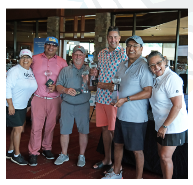
Champion golfers show off their trophies at the post-round awards ceremony.

Hosted by the Shakopee Mdewakanton Sioux Community (SMSC) at "The Meadows at Mystic Lake", the 2023 Mid Year Golf Tournament featured a Four-Person Team Scramble format with a shotgun start. Teams from across Indian Country competed for five placement trophies and closest to the pin and longest drive prizes. Generous sponsors of the event were featured on holes around the golf course and celebrated during the awards ceremony.