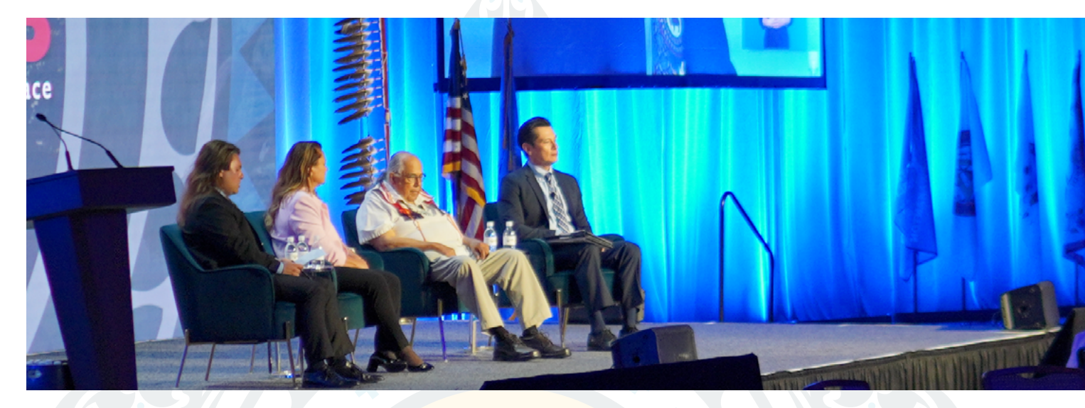
The International Climate Issues and Indigenous Peoples panel discusses how Indigenous communities around the world are addressing the impacts of climate change.

Co-sponsored by Great Lakes Inter-Tribal Epidemiology Center (GLITEC) and NCAI's Movement is Medicine Program, a health walk kicked off Tuesday morning. The event allowed participants to enjoy a beautiful morning walk along the golf cart path at The Meadows Golf Course. Attendees received t-shirts and a light grab-and-go-breakfast before beginning the day in a good way.