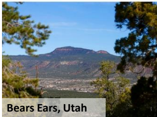
Bears Ears, Utah