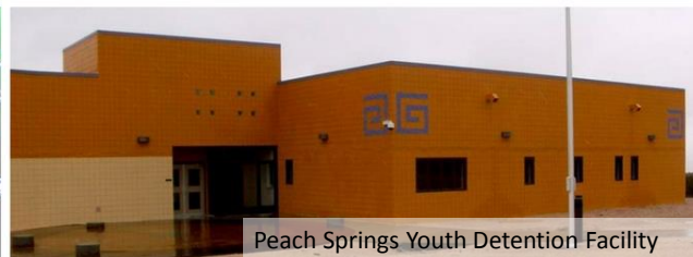
Peach Springs Youth Detention Facility