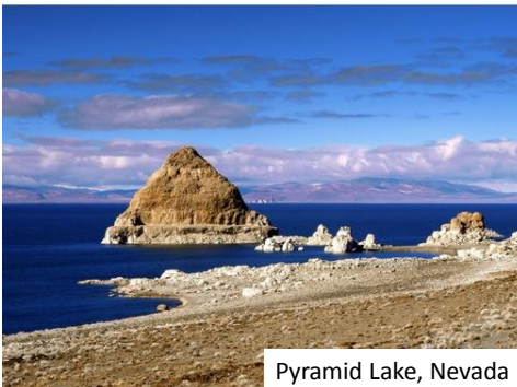
Pyramid Lake, Nevada